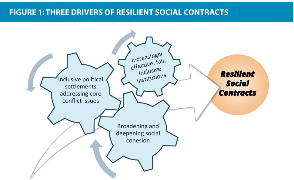
Figure 1 illustrates the three drivers: